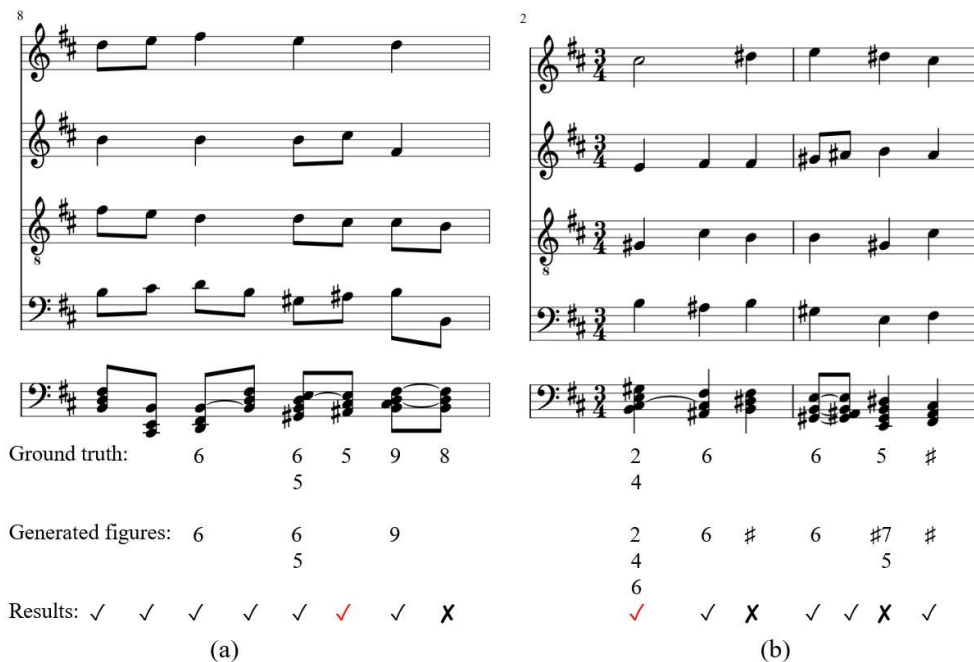
Figure 4. An illustration of figured bass generated by our best-performing model for measure 8 of BWV 108.06 Es ist euch gut, daß ich hingehe , and measures 2 and 3 of BWV 145.05 Ich lebe, mein Herze, zu deinem Ergötzen , which are labelled (a) and (b) here, respectively. We artificially added the fifth (bottom) staff, which collapses all sonorities into one octave so as to more directly reveal the pitch-class content. As discussed in Section 3.3.1, our model predicts interval classes, and the figured bass is generated based on the intervals between the bass note and each predicted interval class. The agreement of each prediction with Bach’s FBAs are shown as well: “✓” means that the generated figured bass exactly matches Bach’s FBAs (the ground truth), “✓” in red means they are considered correct by our evaluation metric that treats musically equivalent figures as equivalent (see Section 3.2.2). An example of the latter can be found at m. 2.1 of (b) where the generated figures can be reduced to “2/4” from “2/4/6” (since the “6” can be omitted, as discussed in Section 3.2.2). “✗” means the generated figures are considered to be errors in our evaluations.